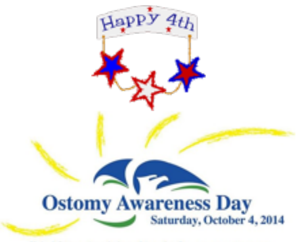
United Ostomy Associations of America, Inc. • www.ostomy.org

Jacksonville group meets the 3rd Sunday of each month 3 p.m. 4836 Victor Street. Ocala support group meets the 2nd Sunday of each month (except July & Aug) at 2 p.m. at the Sheriff's Station 3260 SE 80th Street (between Ocala and Belleview). Amelia Island Area Ostomy Support Group meets last Monday of each month at 6pm - Bapt Medical Center Nassau board room.