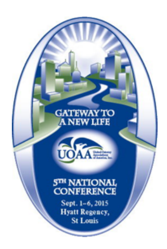
Sept 1-6, 2015 ● Fifth UOAA National Conference ● St Louis MO